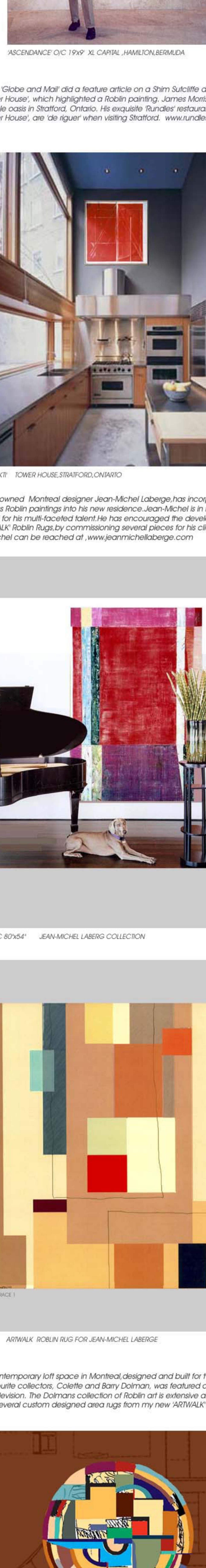
'ASCENDANCE' O/C 19'x9' XL CAPITAL, HAMILTON, BERMUDA