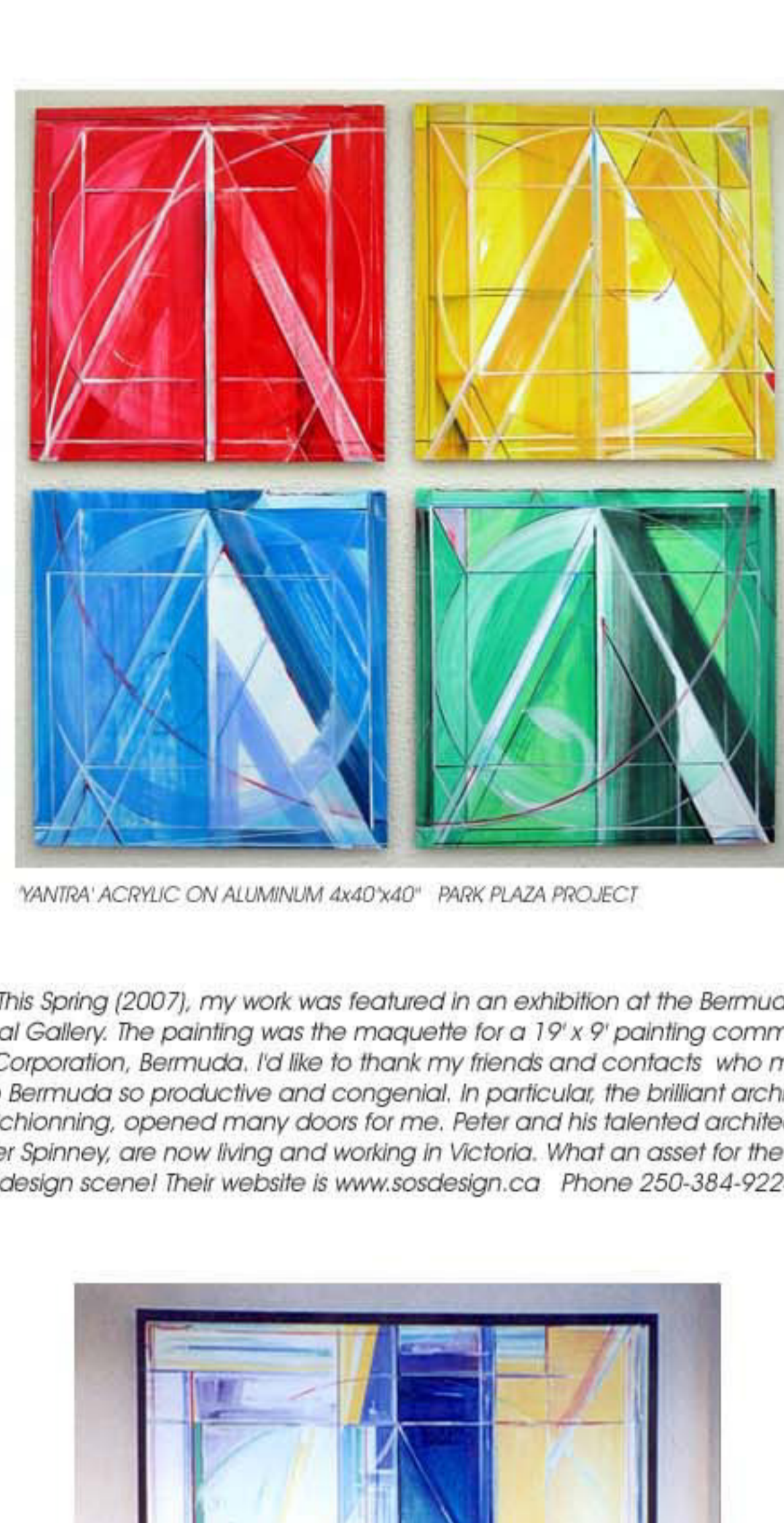
BRANCLSI O/C 80"x54" BONITA SPRINGS SHOWROOM

K2 Design Showroom 2509 Bernwood Bonita Springs, Florida 239-261-2100